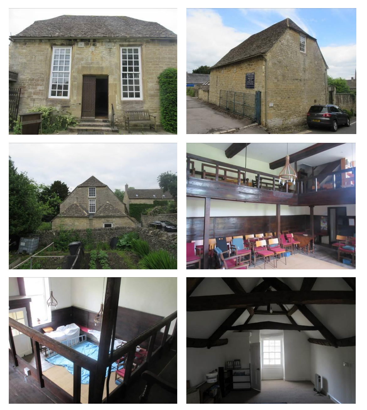
Statement of Significance

Pytts Lane, Burford, Oxfordshire, OX18 4SJ National Grid Reference: SP 25241 12093