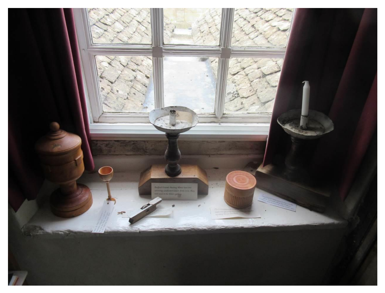
Figure 2: Quaker artefacts displayed in the loft; note original glazing bar detail to window behind

The loose furnishings at ground floor are largely modern, but there are several open-backed benches in the loft, some with barley sugar supports to the arm rests. On the cill of the tall window in the west gable in the loft a number of Quaker artefacts are displayed, including two turned elm candlestick holders dating from 1709 (figure 2).